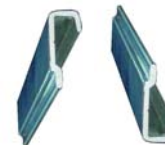
J Cap for top and bottom on all Hidden Fastener