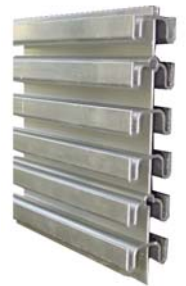
1" Double Sided