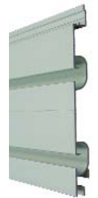
3" Hidden Fastener